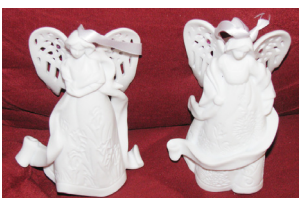
#3 $10 ANGEL with GEM STONE