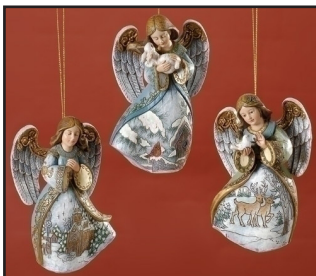
#5 $20 5" ANGEL with PAINTED SCENE