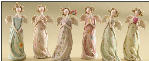
#6 $20 - 5.5" PASTEL GARDEN ANGEL