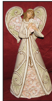
#9 $40 9.25" ANGEL with HEART.