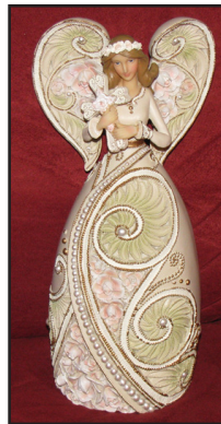
#8 $40 9.25" ANGEL with CROSS.