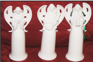
#2 $10 WHITE PORCELAIN ANGEL