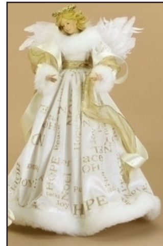
#12 $50 12" ANGEL TREETOP with GOLD HOLIDAY WORDS