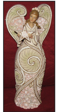
#10 $40 9.25" ANGEL with STAR.