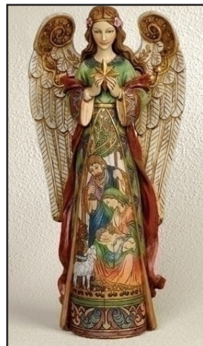
#13 $50 15.75" ANGEL HOLDING STAR with PAINTED SCENE IN SKIRT