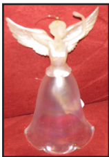
#1 $10 ANGEL BALLERINA