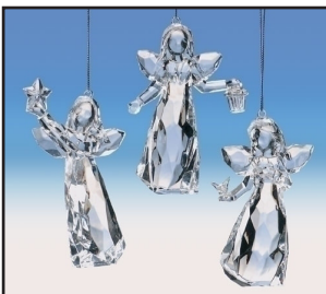
#4 $15 4.5" ICICLE LOOK ANGEL