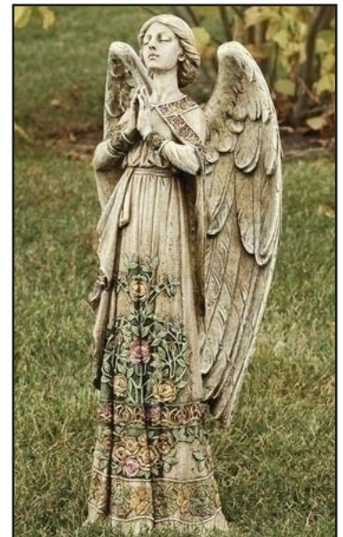
#14 $200 - 24" PRAYING ANGEL GARDEN