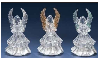
#7 $20 3.75" LED ANGEL